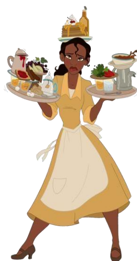
Figure 2. Princess Tiana serving food

Here, we can see a new archetype of woman, as she doesn't try to imitate European standards, but instead always seeks to showcase her ethnic and cultural identity. In Disney, Tiana represents a diverse, active beauty, demonstrating that each wardrobe change reinforces her emotional evolution and independence. We can see a transition between the hardworking Tiana and the princess she aspires to be.