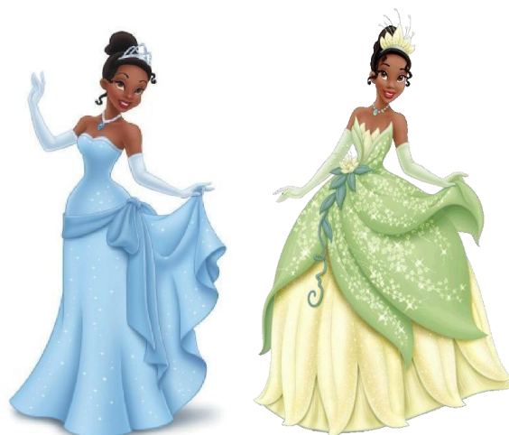
Figure 3. Comparison between The Princess and the Frog. And Princess Tiana.

A symbolic object in the film is the dream restaurant, which represents independence and personal progress. The magical talisman and the enchantments represent a tension between dark forces and the danger of power, which are part of the story's conflict. The frog's transformation in this version is not a punishment but a learning process for both Princess Tiana and Prince Naveen. At the same time, it is a metaphor for personal and couple growth, showing a focus on the value of others beyond appearances. Actions such as hard and honorable work can also be seen as a narrative driving force, something far removed from "magical destiny."